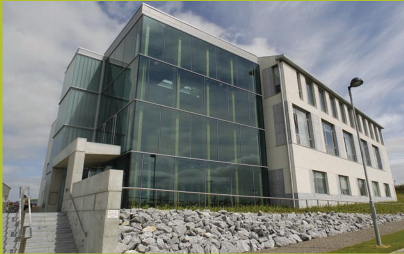
Sólás Building, Institute of Technology Tralee