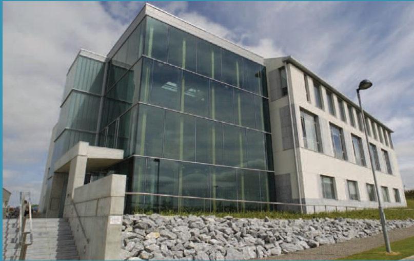
Sólás Building, Institute of Technology Tralee