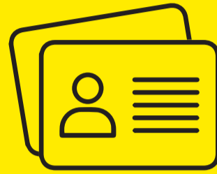
SWIPE YOUR T-CARD