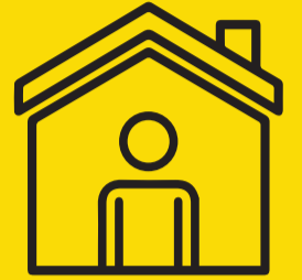
STAY HOME IF UNWELL