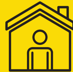
STAY HOME IF UNWELL