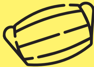
WEAR YOUR MASK